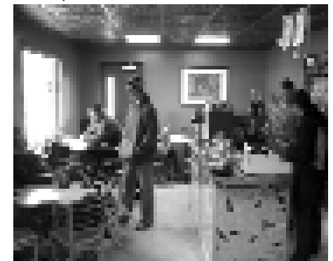
students meet & study in the coffeeshop

I guess when you say a simple prayer like "Lord, just see to it..." you had better be ready to see for yourself what He's already done.