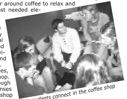
students connect in the coffee shop

In addition to these philosophical issues, there is a practical side to the coffee shop. We hope it will eventually create enough income to support the operational expenses of our facility. That way, the coffee shop becomes our "tent-making" activity to support discipleship, creativity, and missions.