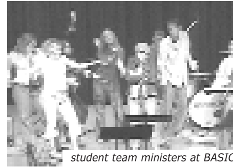
student team ministers at BASIC

The past months have been filled with plenty of opportunities to challenge, exhort, train, and grow! Here are some highlights: